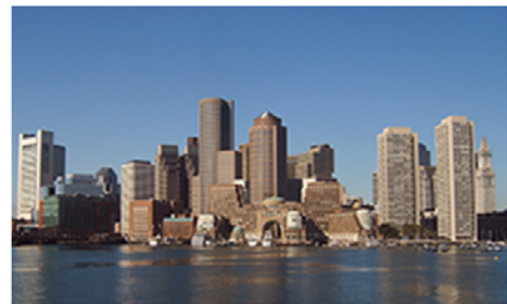
PHOTO: Boston's skyline.

BOSTON —Massachusetts utilities have won approval for a "nation-leading" plan to cut electricity and natural gas sales over the next three years. The 2019-2021 energy efficiency plan, approved by the Massachusetts Department of Public Utilities, would cut aggregate retail electricity sales by 2.7% and cut natural gas sales by 1.25% within the three-year period. The plan provides new tools for an energy-efficiency program run by the state's utilities that gives homeowners incentives to switch to electric heat pumps. For commercial and industrial users, energy storage, "strategic electrification," and demand response will be promoted.